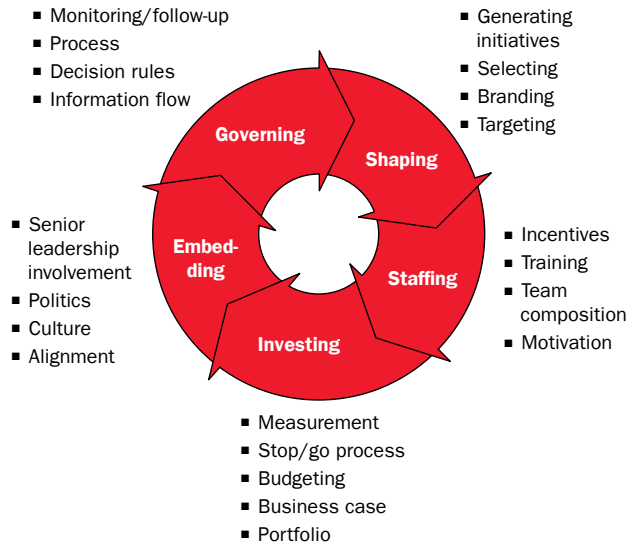
Exhibit 1 Growth: The Five Elements